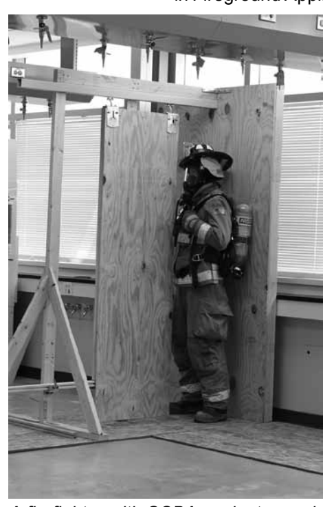
A firefighter with SCBA navigates various space configurations to measure a number of factors, including gait and functional balance.

rope systems and particularly studies escape rope materials in realistic service conditions. The study aims to determine the failure mechanisms of rope systems and then design and test new thermal protection technologies to improve the functional capability of current escape rope systems. Underwriter's Laboratories (UL) and Fire Department, City of New York (FDNY)'s research and development unit are serving as an independent partners for these studies. The researchers have completed their data collections and are in the process of preparing the final report.