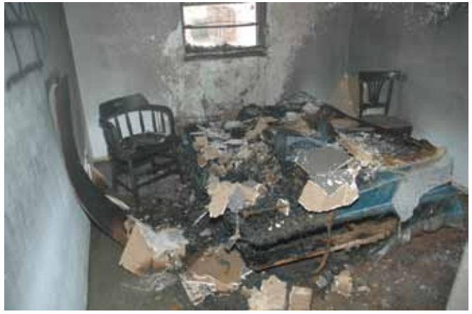
There are several fire investigation classes available at IFSI. The foundational fire investigation training classes, sometimes referred to as the "Modules", are fee-based classes scheduled by IFSI through host departments around the state and on the IFSI campus. The modules consist of three 40-hour classes delivered four or five times a year around the state.