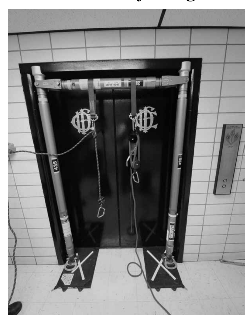
mechanical devices can be used to hoist or lower rescuers from this anchor. In conclusion, like I said, this is not a change – just another tool for the tool box.