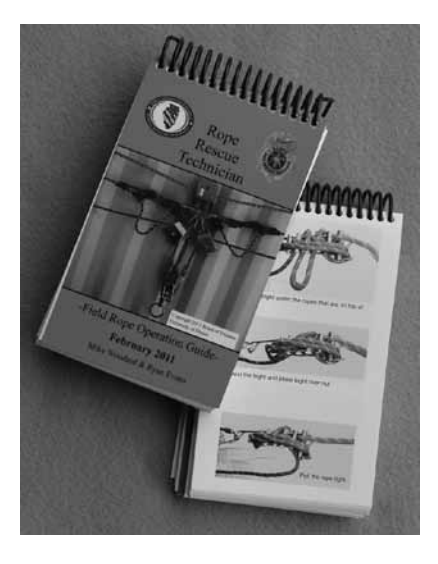
"Rope Rescue Technician Field Rope Operation Guide" can be ordered from IFSI for $75. The proceeds from the book go into IFSI's Fire Fighting Fund.